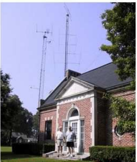
W1AW transmitter building

* If we do not meet a 30 person minimum your money will be refunded in full.