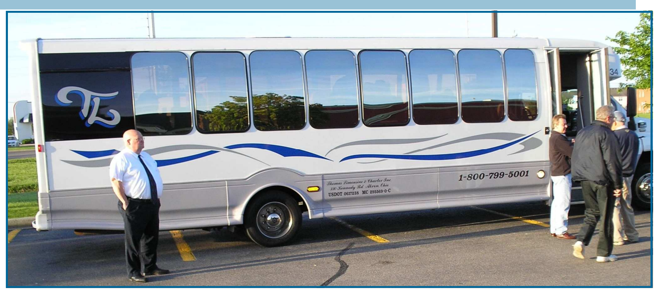
The bus, ready to roll.