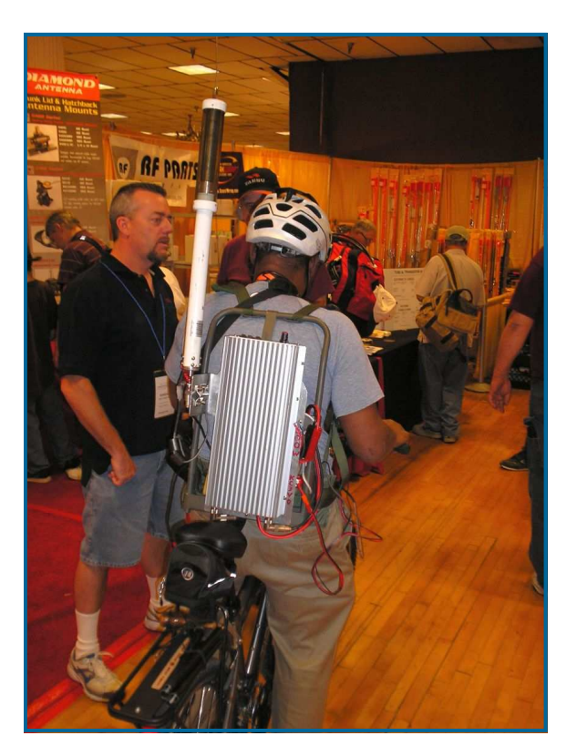
Bicycle mobile, with a screwdriver antenna!