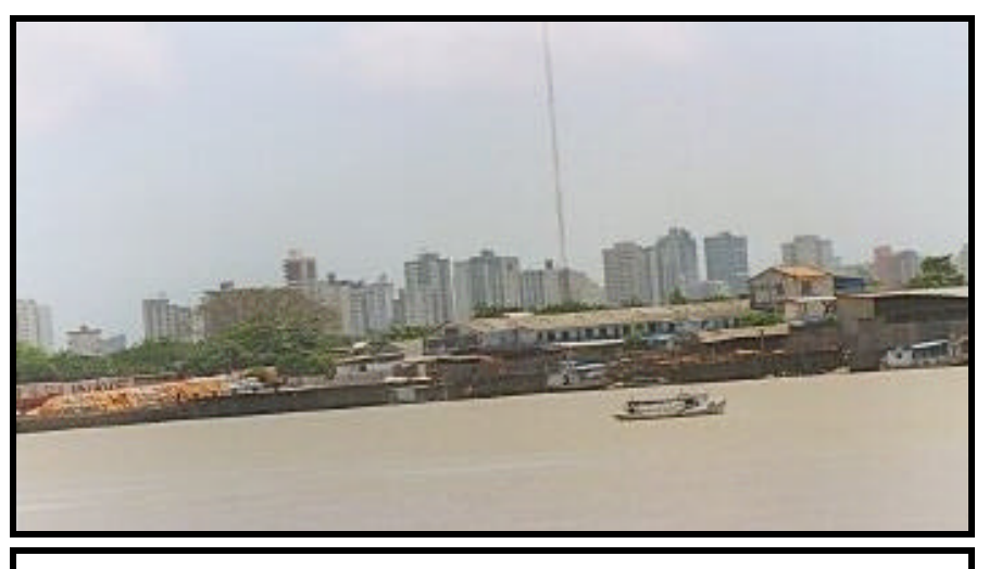
This is PY8-Land: The city of Belem seen from the bay which forms part of the complex mouth of the Amazon River.

As in the US, Japanese-Brazilians would lose freedoms and material possessions during and right after WW II. They were disliked and mis-