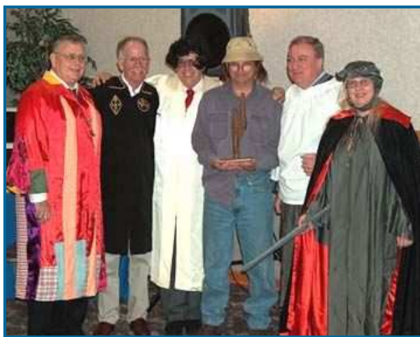
The Royal Order of the Wouff-Hong