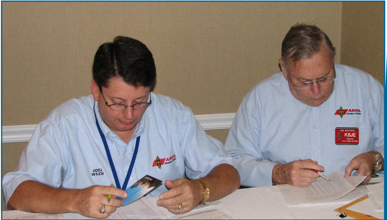
W5ZN, ARRL President, and K8JE, Great Lakes Division Director, checking cards