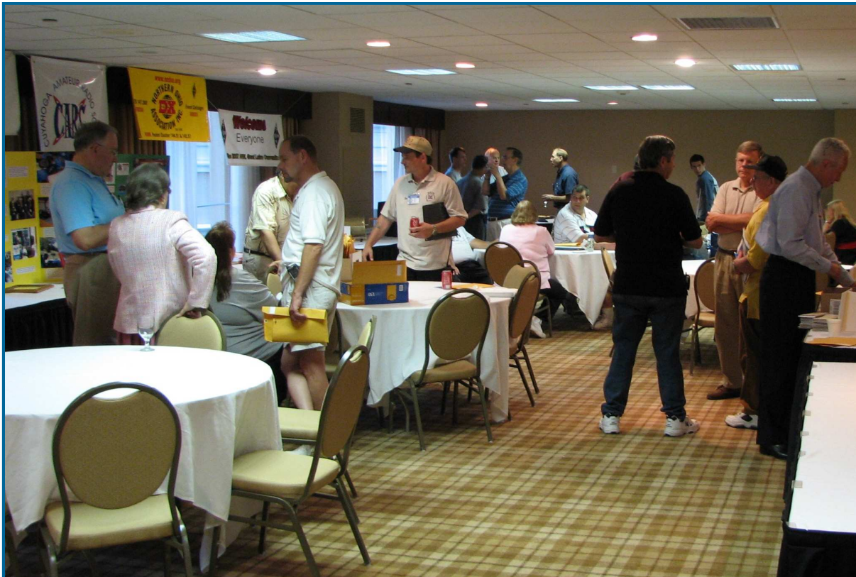
The hospitality suite was the place to be between seminars