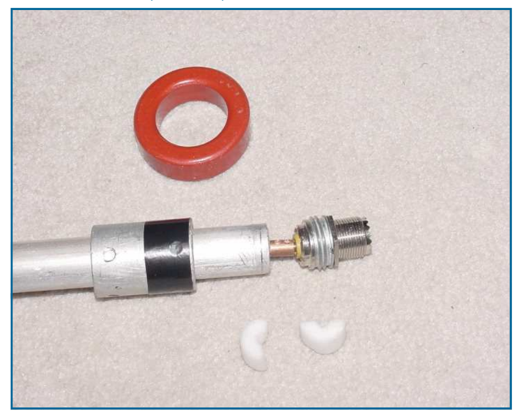
Figure 2 - Here the prepared connector plug center pin is being soldered to the cable center pin via a 1/2" length of 1/4" copper tubing (typical as used in icemaker installations).