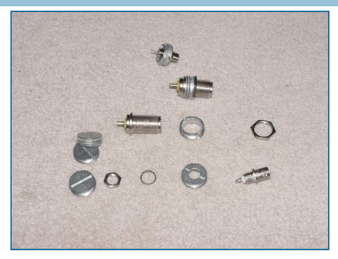
Figure 1: Threaded aluminum plugs of the kind sold to seal off unused holes in outdoor electrical junction boxes are drilled to accept a variety of RF connectors.