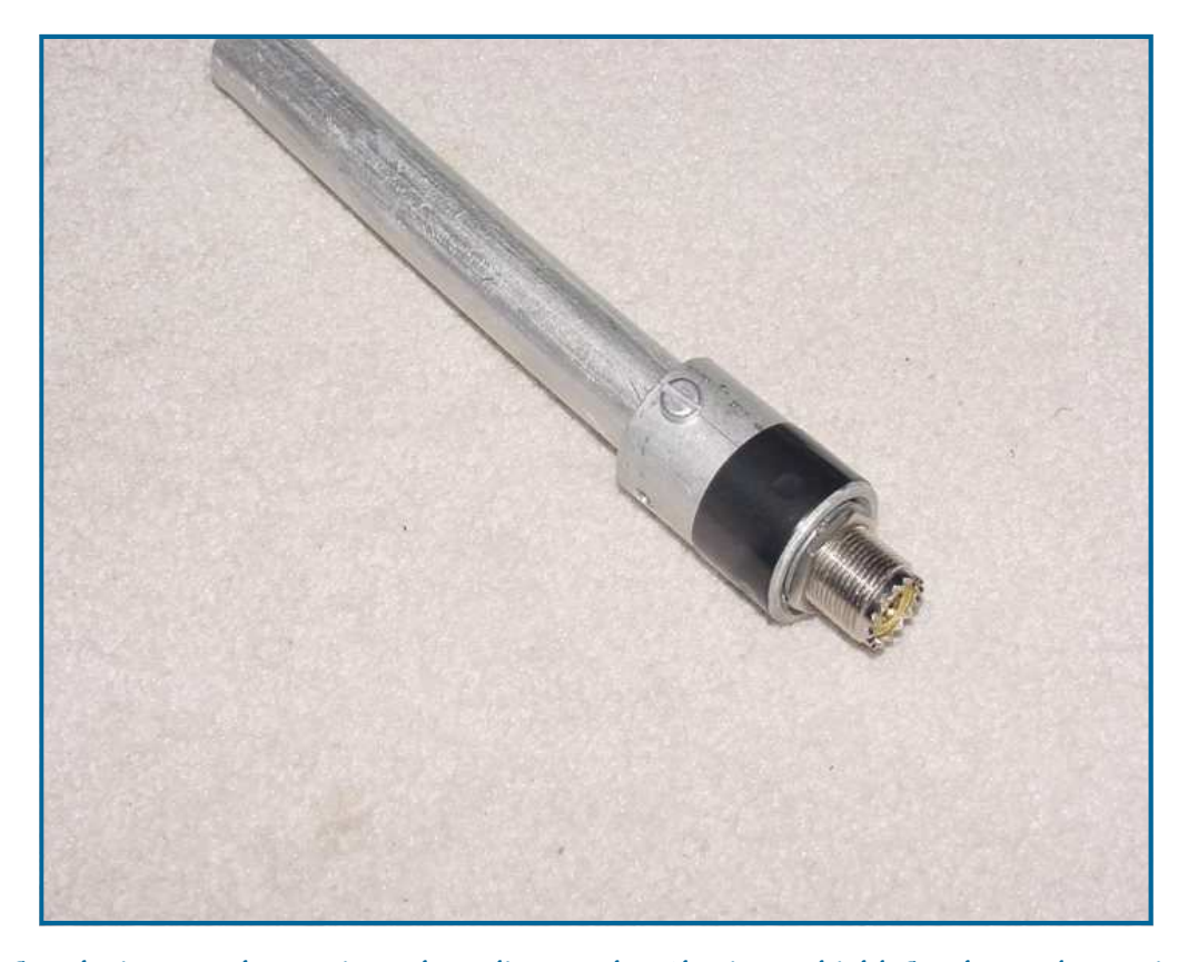
Figure 4 - Completion merely requires threading on the Aluminum shield Coupler and securing with screws.