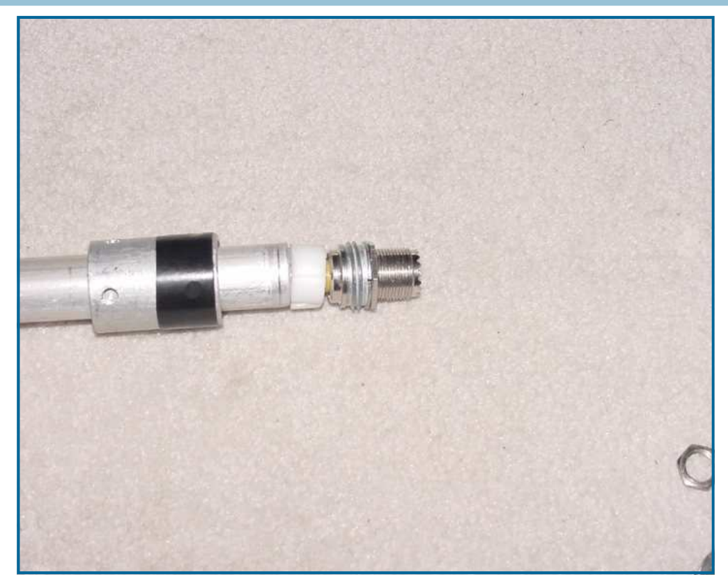
Figure 3 - Next insert the dielectric material saved when the cable was prepared.